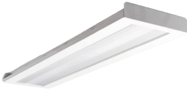
OMBRE GRID LED