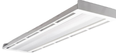
OMBRE AIR LED