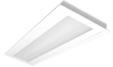
OMBRE PLASTER LED